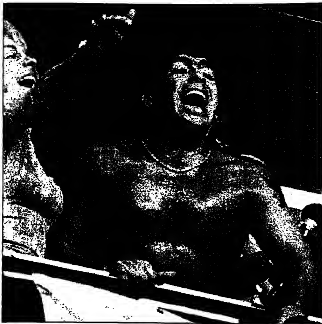
Diego Maradona, seen here watching a soccer game, said he's through playing in his native Argentina.

Maradona, considered one of the most gifted players in the history